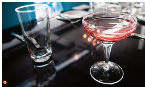
Corner Suite Bistro de Luxe has a drink for everyone. PHOTO SUBMITTED

There's a whole page dedicated to just champagne cocktails! As a big fan of the ole bubbly, it was almost too much for me to process at once. Do I get the Ritz with Cognac, Cointreau, sugar and orange or the Hemingway with Pernod or perhaps a classic Kir Royale