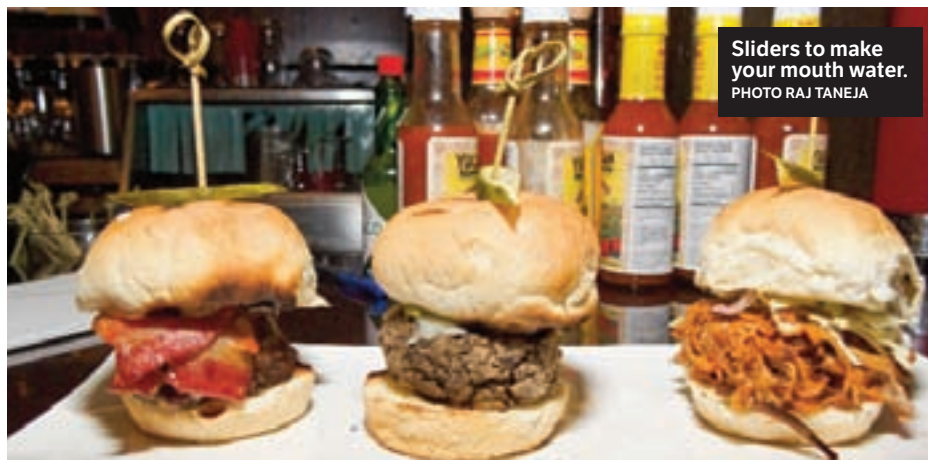
Sliders to make your mouth water.

R: So this place they call Revel, located at 238 Abbott