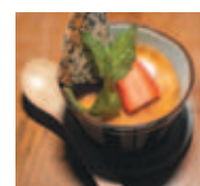
Sake Kasu Brûlée