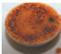
Busset's crème brulée

Back to the brulée. Busset undoubtedly experimented to get the right mix - three halved amarena